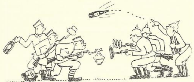
Instead of armaments nations should force their surplus goods on each other.

We shall, of course, observe the rules of war so long as the enemy plays the game; but if the foreigners persist in their refusal to accept our exports, we shall not hesitate to rain British-made goods on undefended cities.