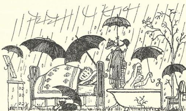
The Umbrella will solve the housing problem.

If that happens we shan't have to worry about the umbrella because it would be natural, and part of the simple life. We should not try to do without it unless we had an umbrella-ache, in which case we should have it