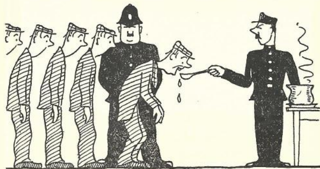
We shall be a well-planned, well-fed and obedient nation.

If the people could buy what they liked they would be able to live how they liked. Now, I have made an ex-